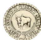
COUNTY OF SUFFOLK