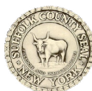
COUNTY OF SUFFOLK